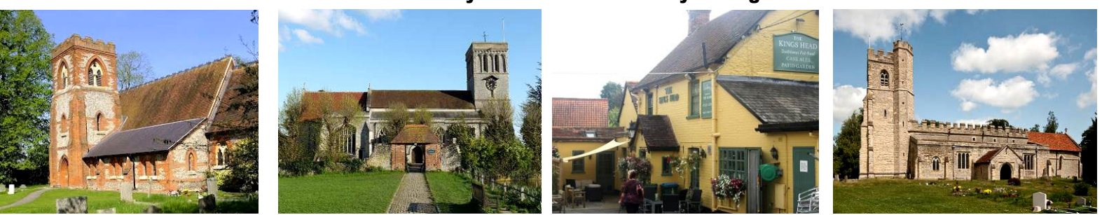
(Stoke Mandeville (8) 8cwt, 10.00am, Haddenham (8) 17cwt, 11.30am. Lunch at The King's Head, Haddenham. Dinton (6) 15cwt, 2.15pm) Please click on the link below for the Menu at the King's Arms, and then let Hugh know your food order as soon as possible: http://www.kingsheadhaddenham.co.uk/Kings%20Head%20Menu%202014.pdf